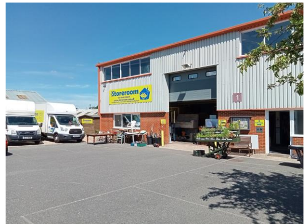
1 Mariners Way, Cowes, PO31 8PD Open Tuesday to Saturday 10am-4pm

The Island Probation Service send clients to Storeroom who are required to work unpaid hours. Community Payback Individuals often find themselves motivated by the industrious, but enjoyable community environment at Storeroom2010 and some stay on as volunteers.