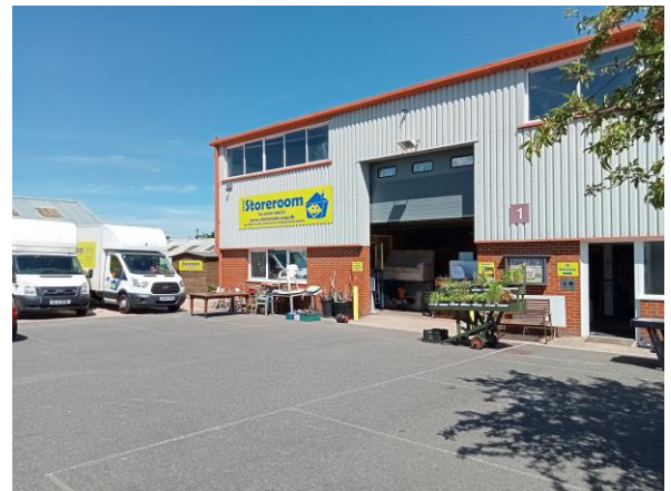
1 Mariners Way, Cowes, PO31 8PD Open Tuesday to Saturday 10am-4pm

The Island Probation Service send clients to Storeroom who are required to work unpaid hours. Community Payback Individuals often find themselves motivated by the industrious, but enjoyable community environment at Storeroom2010 and some stay on as volunteers.